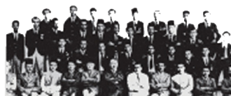
Arab Culture Association's